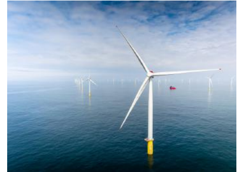
Indicative Offshore Wind Farm: Dudgeon, UK